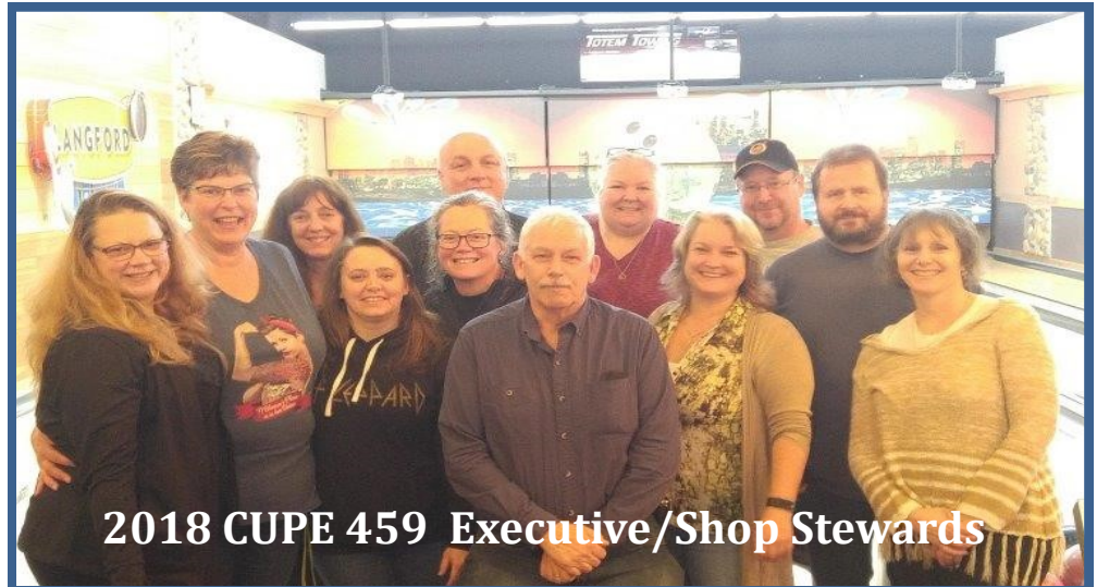
2018 CUPE 459 Executive/Shop Stewards

On behalf of the executive I would like to extend an opportunity to you to be part of a local 459 contest as motioned by the general membership at last Saturdays meeting.